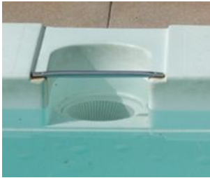
Dangerous skimmer box

No- Fix a permanent protective lid to the filter inlet. Manufacturers or repairers of fibreglass pools should be able to carry out these repairs (you can find them in the Yellow Pages). Also, your local swimming pool supplier may have a low cost conversion kit for the old style skimmer box.