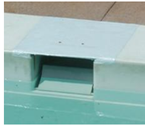
Safe modified skimmer box